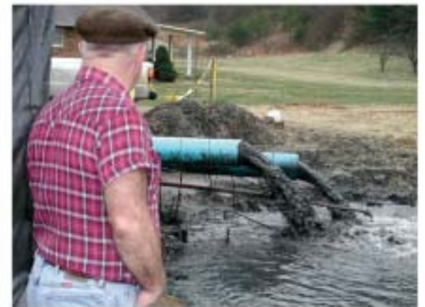
Roughly 300 million gallons of coal slurry devastated 75 miles of rivers due to a breakthrough beneath a KY waste impoundment in October 2000.