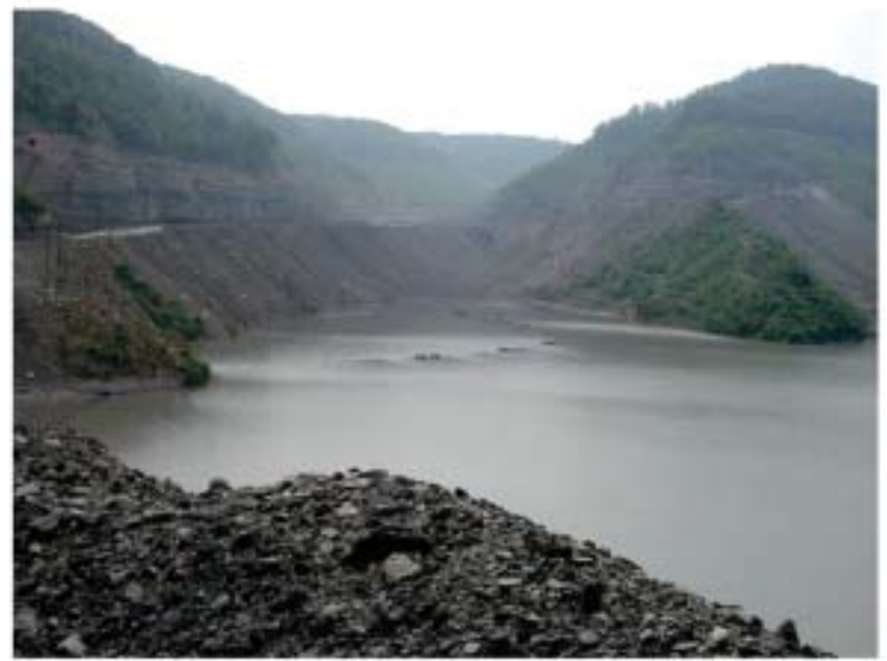
Brushy Fork impoundment, planned to grow to a 920-foot dam height (higher than the New River Gorge Bridge), may potentially store 5 billion gallons of coal slurry.

St. Albans' water supply intake lies downstream of these significant risks.