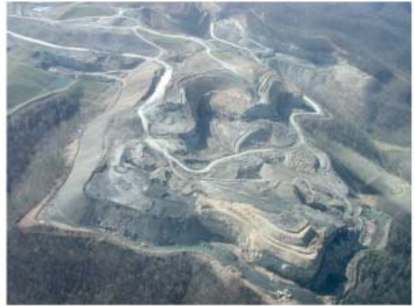
Mountaintop removal mining such as the site shown is prevalent in the Coal River Basin.

The area of all surface mining permits shown in the Coal River Basin is equal to roughly 72,555 football fields.