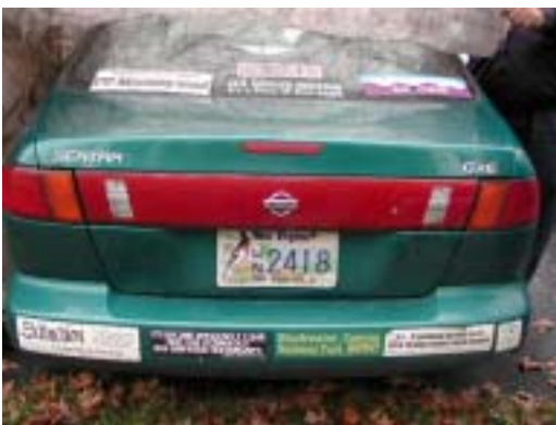
Above, Laura's car - just a few bumper stickers! ... at right, cleaning up after the summer 2001 floods in Bulghar Hollow, Raleigh Co. - a valley fill is just visible in top center of photo.