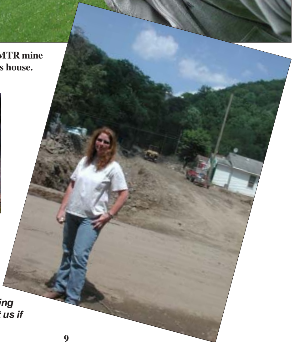
"We really HAVE to keep fighting now, she'll come back and get us if we don't." Anonymous