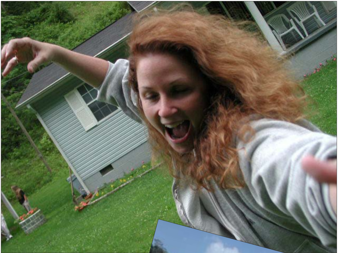
In Logan County; a huge MTR mine is slated to go in above this house.